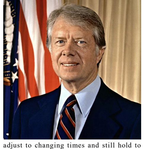
adjust to changing times and still hold to unchanging principles.” —Inaugural Address, January 20, 1977 “To me, faith is not just a noun, but also a verb.” —From Living Faith by Jimmy Carter, 1996